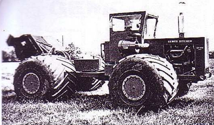
Tractor with Enclosed Cab