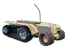
TRACTOR LEVER, FLEX, PIVOT, ROCK & ROLL

Quick response; start, stop, left or right turn, with good stability. The features required for RAS (remote, autonomous systems.)